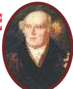
DR. SAMUEL HAHNEMANN (FOUNDER OF HOMOEOPATHY)